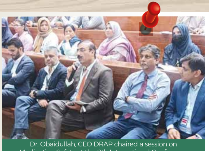
Medication Safety at the 8th International Conference of Patient Safety.