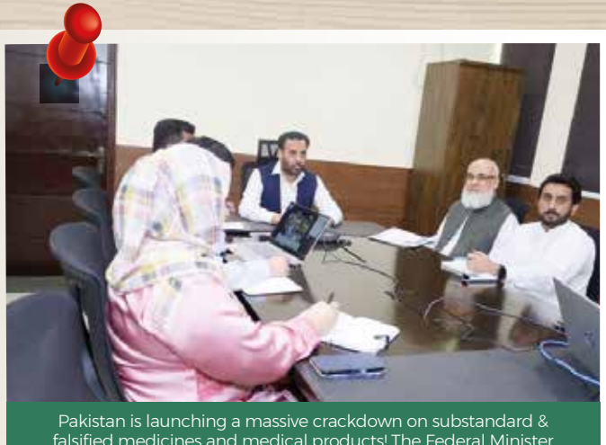
chaired an online high-level meeting of Health Ministers.