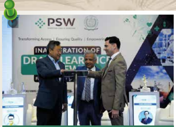
PSW and the Drug Regulatory Authority of Pakistan (DRAP) have officially launched the DRAP Clearance Gateway