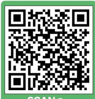
Hospital Medicine Shortage Reporting

ادویات کی بروفت فراہمی نہ صرف مریض کی جان بحاتی ہے بلکہ نظام صحت پر عوام کے اعتاد کو بھی بحال کرتی ہے۔اس قومی مہم میں ہمارا کر دار ذمہ داری اور تعاون پر مبنی ہوناچاہیے۔