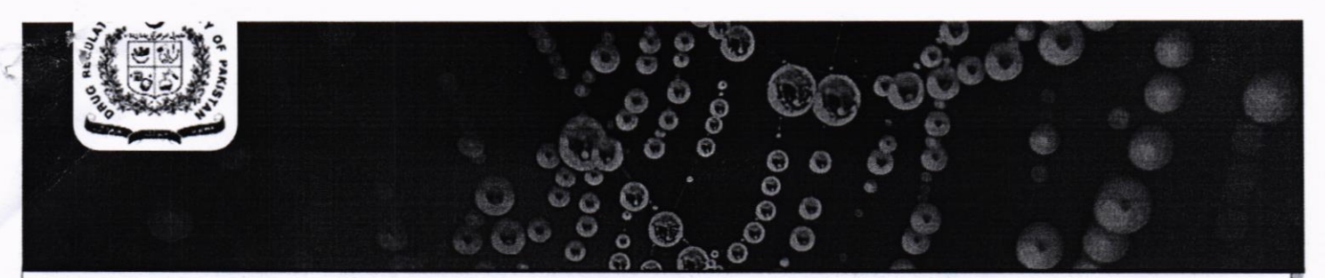
Action to be taken/ Advice for Healthcare Professionals and general public: -

DRAP requests increased vigilance within the supply chains of institutions/pharmacies/healthcare facilities likely to be affected by this spurious products batch.